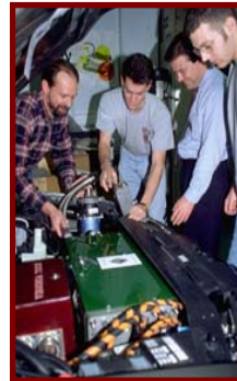
Students and professors work on a fuel cell stack in the Center for Automotive Fuel Cell Systems.

The Mechanical Engineering Department research expenditures average over $4.5 million per year. The department has a number of specialized laboratories on and off campus. There is over 66,000 sq. ft. devoted to research and teaching activities with five research centers headquartered in the department. They are the Center for Turbomachinery and Propulsion Research, the Energy Management Institute, the Center for Automotive Fuel Cell Systems, the Center for Intelligent Material Systems and Structures, and the Vibration and Acoustics Laboratories. In addition, many faculty members are actively involved in interdisciplinary centers including the Center for Adhesive and Sealant Science, the Center for Biomedical Engineering, the Polymer Materials Interfaces Laboratory, the Center for Composites Materials and Structures, the Virginia Tech Transportation Institute, the Manufacturing Systems Engineering Center, the Center for Energy and the Global