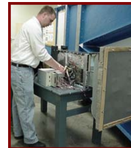
Facility for testing louvered fins for compact heat exchangers.